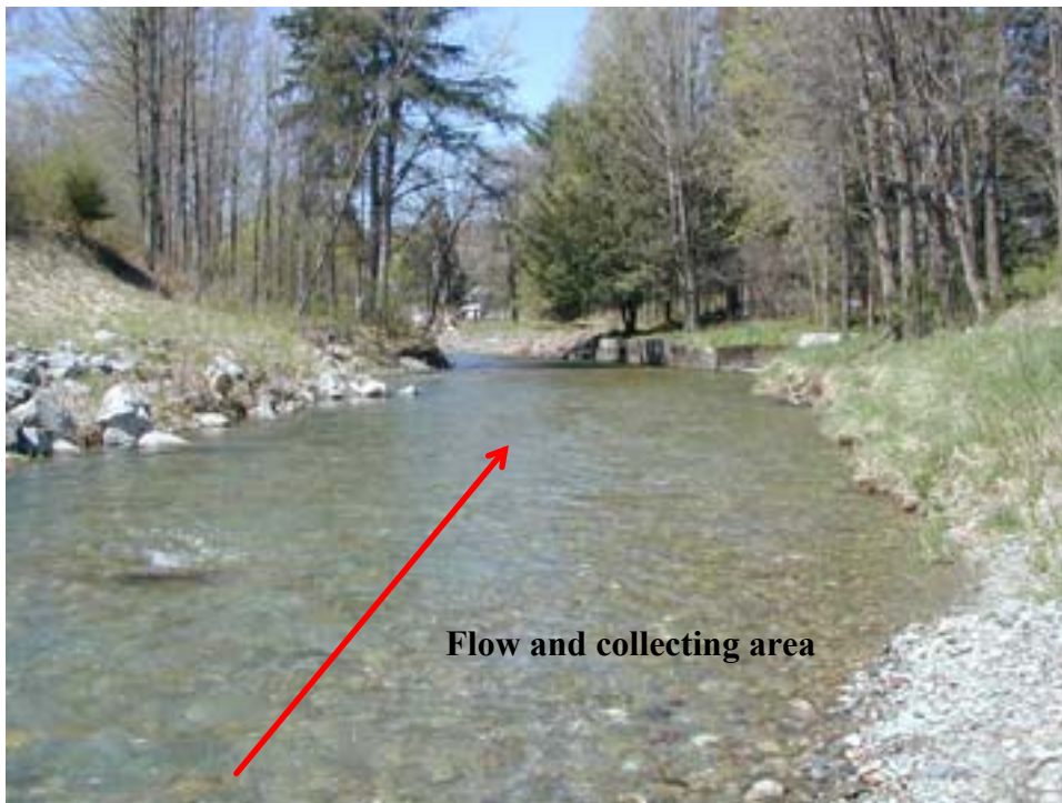
Flow and collecting area