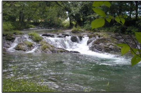
White Creek, Washington County, NY